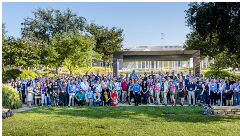
Left: NAPB Members at the 2017 Annual Meeting. Get to know your fellow members and serve the plant breeding community on a committee!